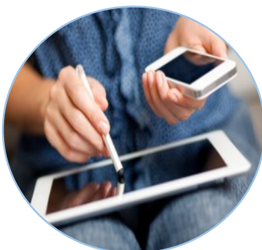
Phone & Tablet Training